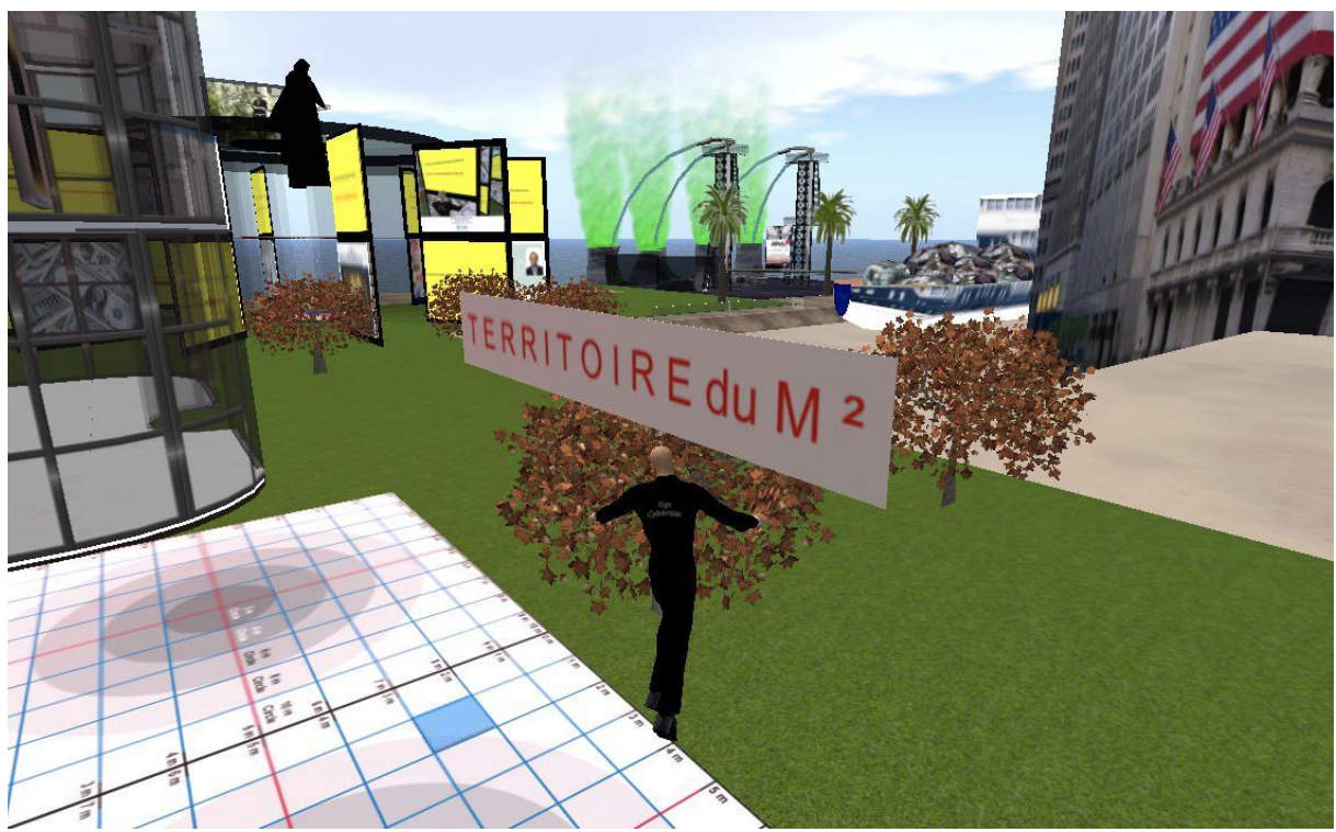
The M2 Territory on Second Life in 2008 on the Promenade des Anglais in Nice where it was first dematerialized.