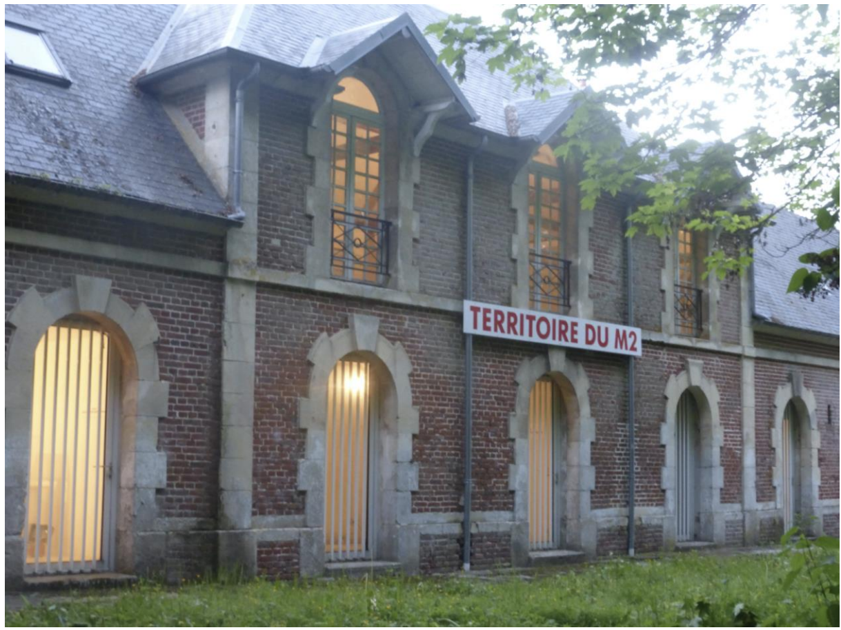
Below is the new M2 Territory Cadastre created in Anserville and its programmatic forecast.

taken that condition our lives without us ever knowing their scope or their rigorous application, and to which we will only have the freedom to conform with a smile. Those who would not do so would be immediately banished, considered and treated as reprobates for life.