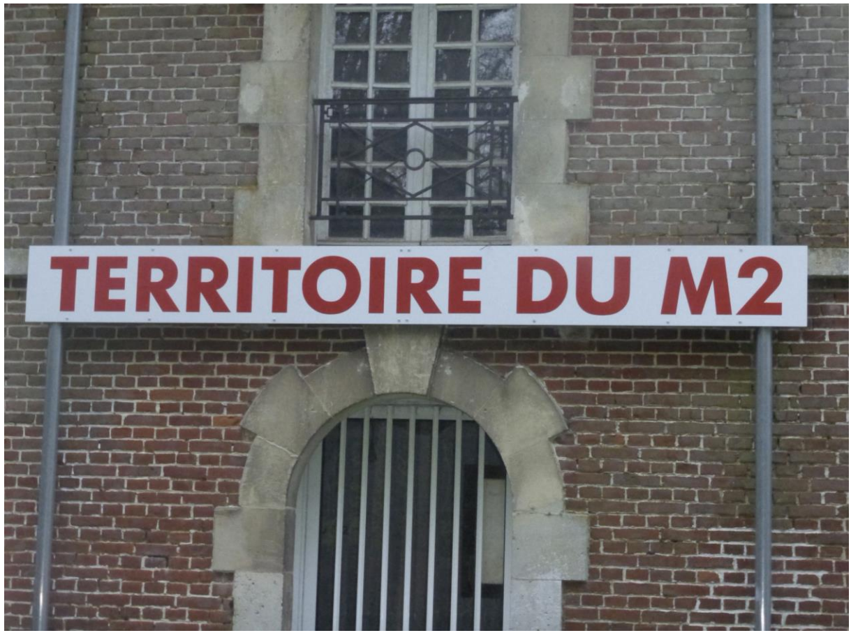
Seat of government of the artistic M2 territory located in Anserville, in the Oise.