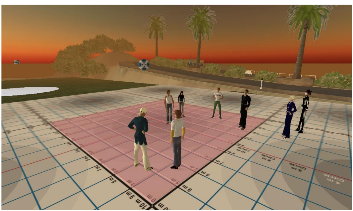
M2 territory, tokenized parcel, Second Life/NFT